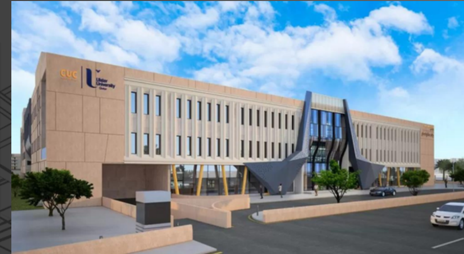
CITY UNIVERSITY COLLEGE, AL ERKYAH, LUSAIL