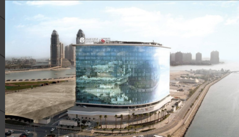
THE VIEW HOSPITAL, QATAR