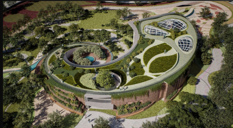
QUR'ANIC BOTANIC GARDEN EDUCATION CITY, QATAR