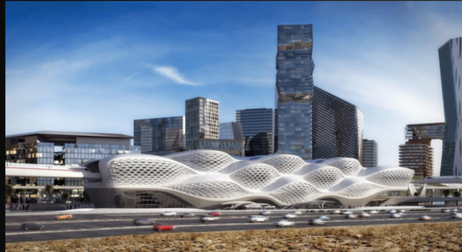
BACS RIYADH METRO PROJECT, RIYADH, KSA