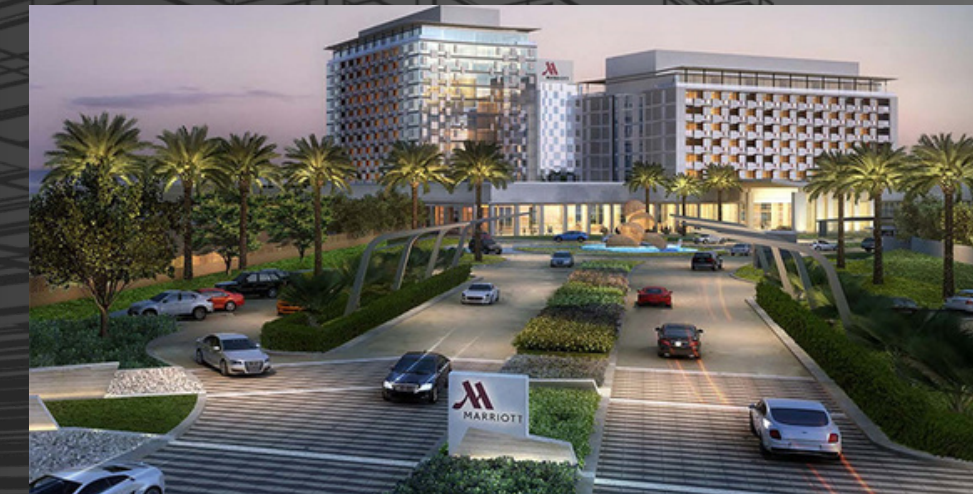
DOHA MARRIOTT GULF HOTEL