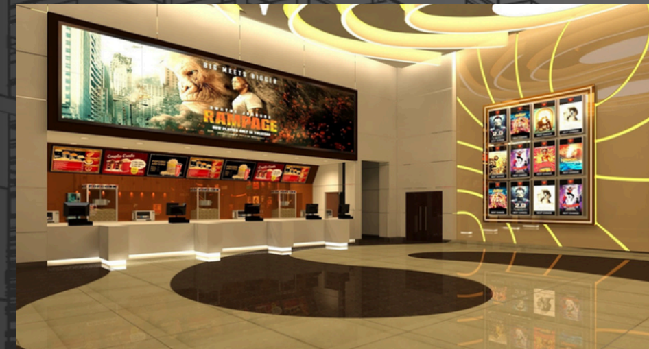
WOW CINEMAS, SALALAH GRAND MALL, OMAN