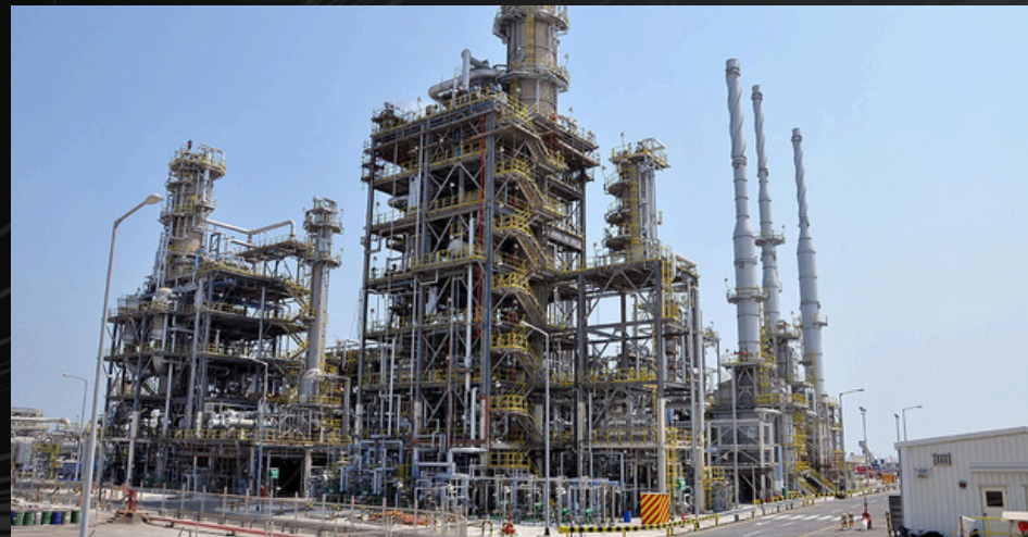
BAHRAIN PETROLEUM COMPANY