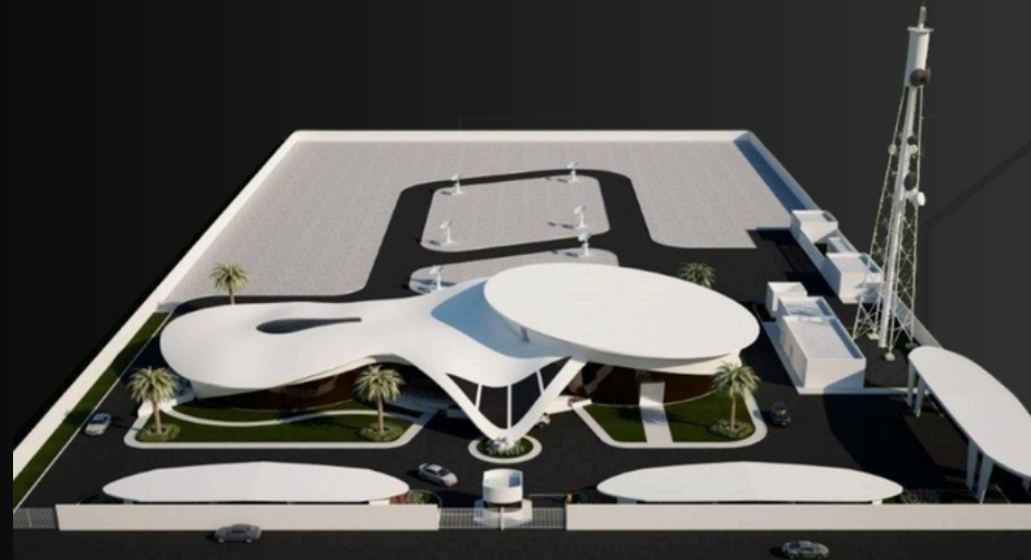
SATELLITE MONITORING CENTER, AL MARKHIYA WEST, QATAR