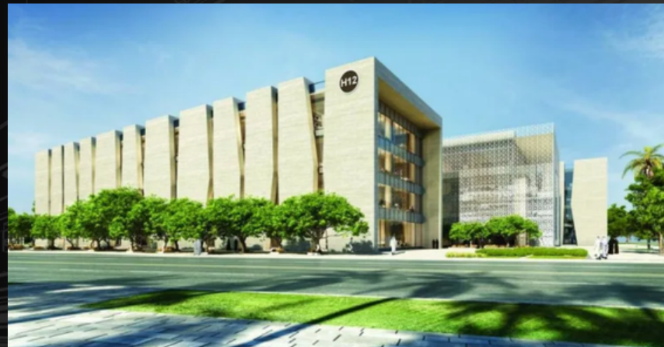
COLLEGE OF MEDICINE AND HEALTH SCIENCES, QATAR