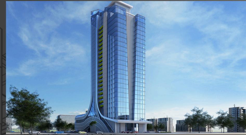
AHLI BANK HEADQUARTER AND COMPLEX, LUSAIL, QATAR