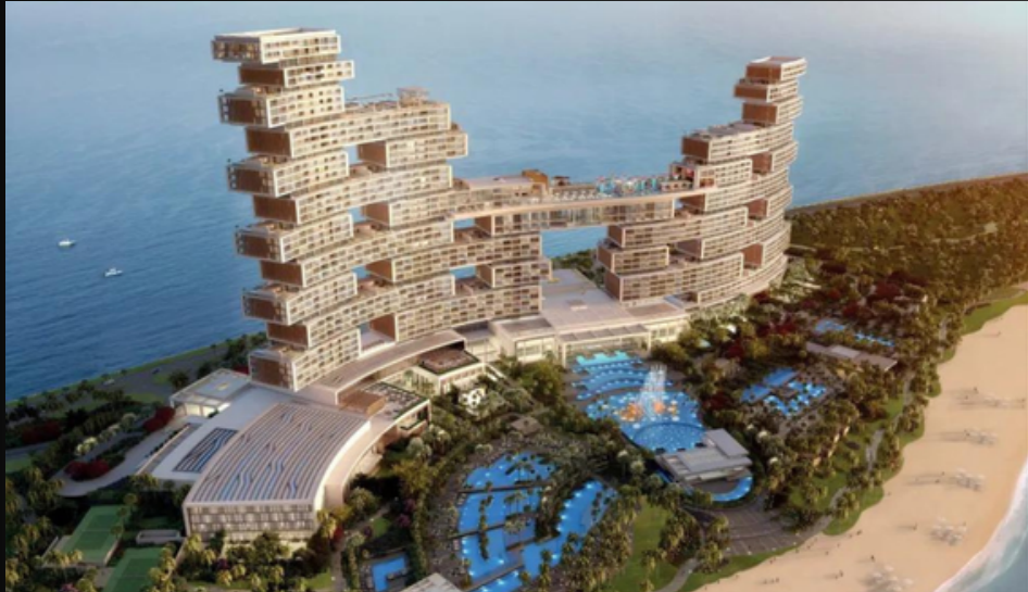
THE ROYAL ATLANTIS RESORT AND RESIDENCES PALM JUMEIRAH CRESCENT , DUBAI U.A.E