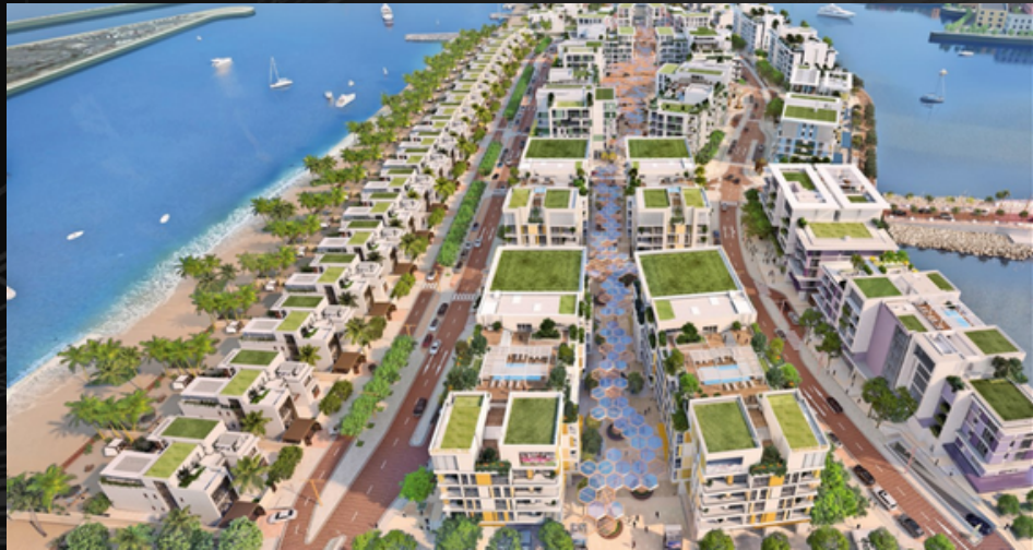
CORINTHIA GEWAN VILLAS AND PROMENADE , QATAR