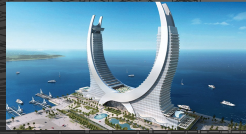
KATARA TWIN TOWER HOTEL, QATAR