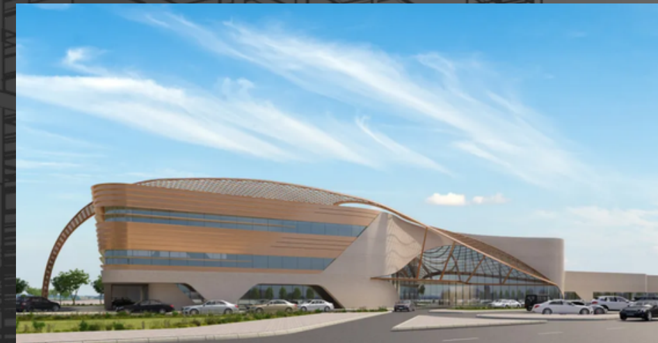
LUSAIL SURGI-ART CENTER