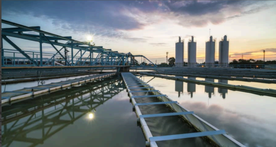
REHABILITATION AND UPGRADING OF IRBID CENTRAL AND WADI ARAB WWTPS , JORDAN