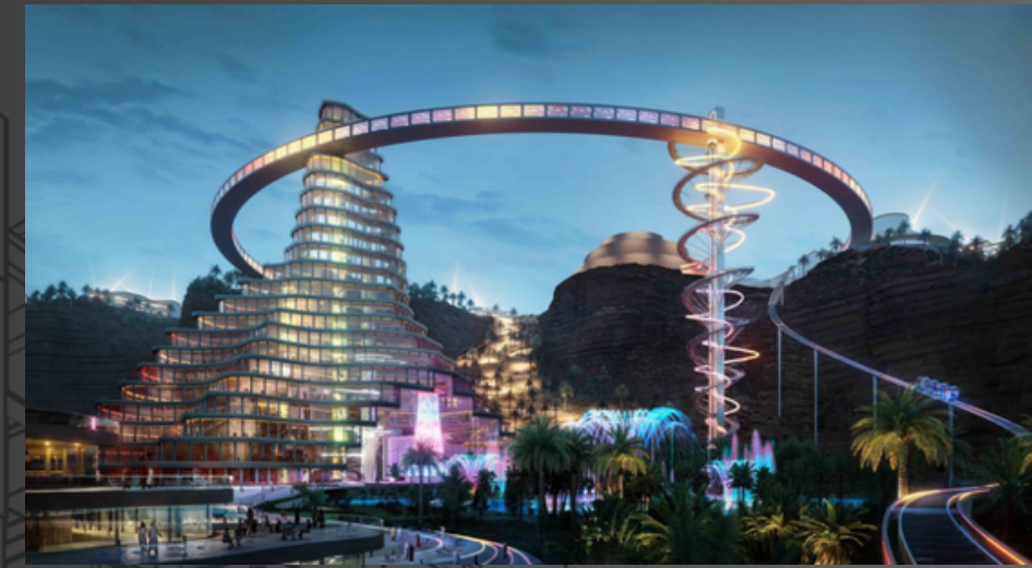
QIDDIYA SIX FLAGS, KSA