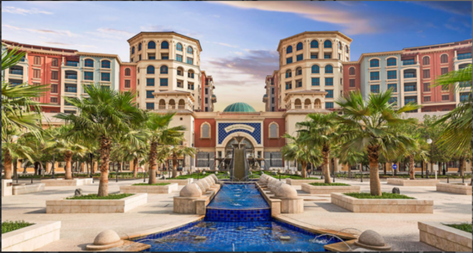
THE PEARL INTERNATIONAL HOSPITAL QATAR