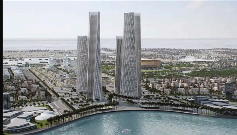
LUSAIL PLAZA TOWER, QATAR